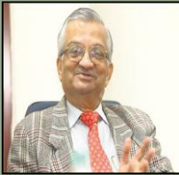
Dr. Anil Kakodkar